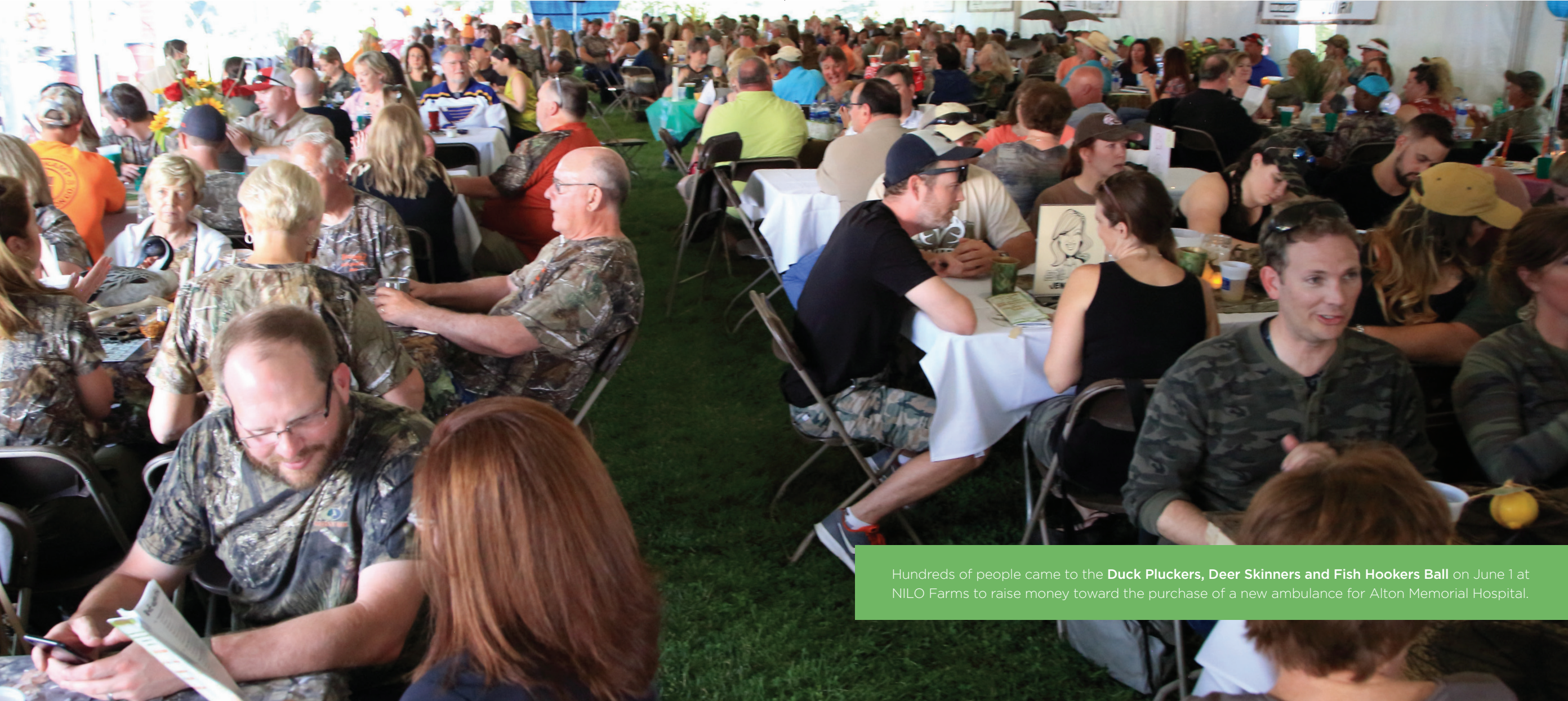
Hundreds of people came to the Duck Pluckers, Deer Skinners and Fish Hookers Ball on June 1 at NILO Farms to raise money toward the purchase of a new ambulance for Alton Memorial Hospital.

Alton, Bethalto, Brighton, (Parts of) Bunker Hill, Cottage Hills, Dorsey, East Alton, Fosterburg, Godfrey, Hartford, Holiday Shores, Meadowbrook, Mitchell, Moro, Prairietown, Rosewood Hights, Roxana, S. Roxana, Wood River